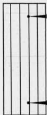
FIG 3B ledged and braced