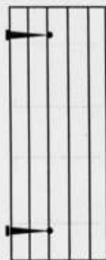
FIG 1B ledged only