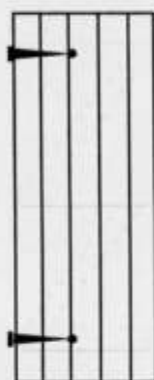
FIG 2B ledged and braced